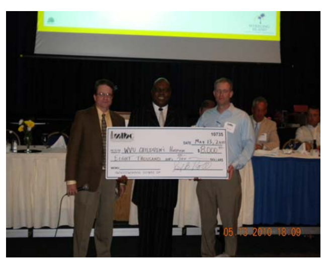
WV Children's Hospital contribution