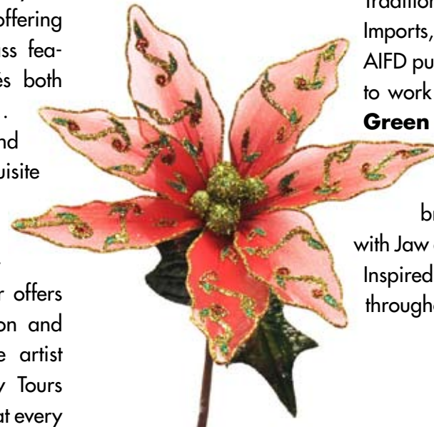
Calisino: IFGC 1F115

A walk through the International Floral and Gift Center offers so many points of inspiration and Sparks the creativity of the artist within. Our Daily Discovery Tours highlight the BEST in SHOW at every Holiday and Home Expo.