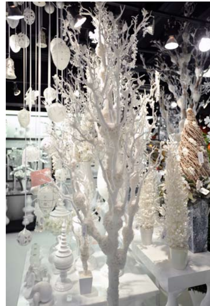
Royal Green: IFGC 1F117

Knowing your market and connecting with your Customers is the Success Solution for 2009...and the Dallas Market Center and International Floral Gift and Center have created the MUST BE Destination for all your Christmas Purchases. If you're in the Christmas Business...Dallas is the Place to BE!