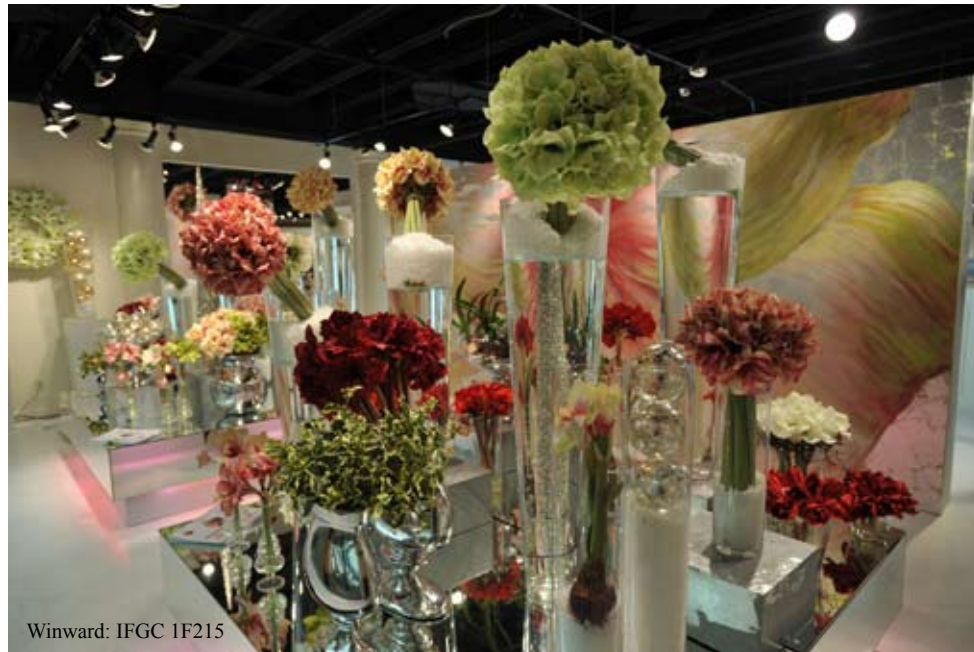
Winward: IFGC 1F215

Glass was expertly reinvented by the Artists at Diamond Star offering unique updates to clear glass featuring cutouts and appliques both contemporary and modern... along with Incredible Hand blown Perfume Bottles in exquisite detail.