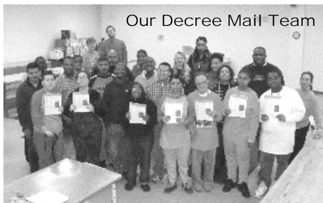
Our Decree Mail Team